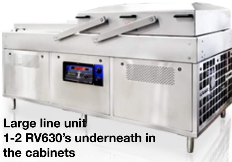
Large line unit 1-2 RV630's underneath in the cabinets

. . . there's vacuum pumps nearby. Or, THESE are the droids you are looking for.