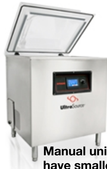
Manual unit will have smaller pumps.